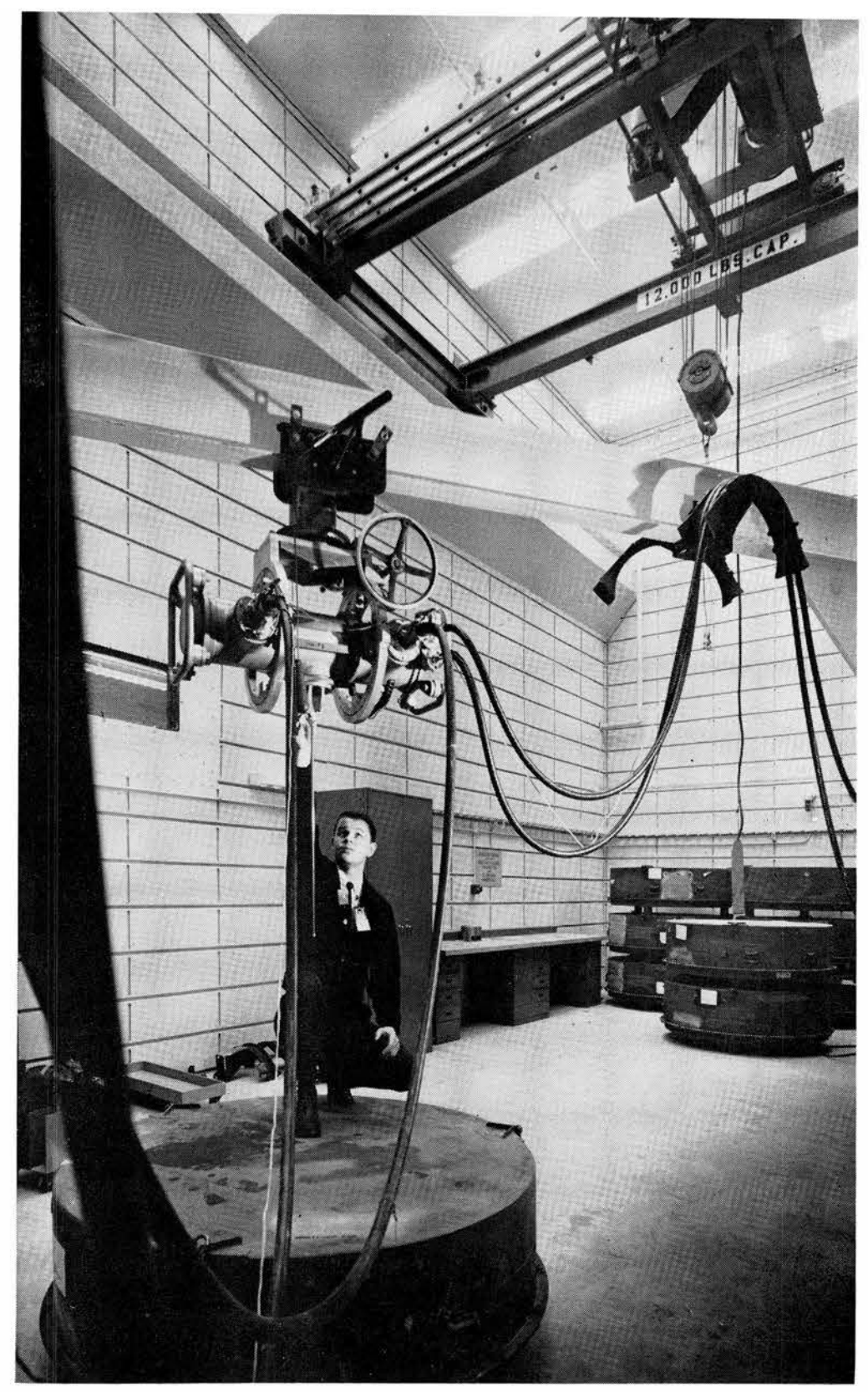
A 300-KV INDUSTRIAL X-RAY UNIT is being positioned by Dennis J. Adkins preparatory to examining a sealed parachute case. The high ceiling and overhead crane provide easy handling for large objects.